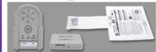
Wire•Less® Patient Monitoring System