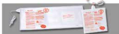
Bed Pad-1 & Chair Pad-1