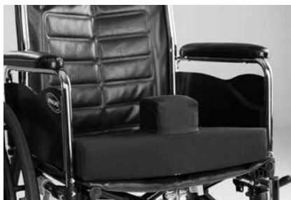
Secure ® Convex Pommel Cushion

Visit www.SecureSafetySolutions.com for more Wheelchair Cushions, Belts & Accessories