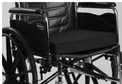
Secure ® Gel Cushion