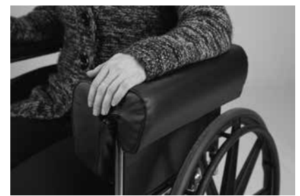
Secure ® Deluxe Arm Support