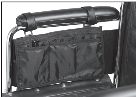
Secure ® Wheelchair or Walker Pouch in Black

Visit www.SecureSafetySolutions.com for more Wheelchair Cushions, Belts & Accessories