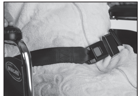
Secure ® Non-Alarming Quick- Release Wheelchair Seat Belt