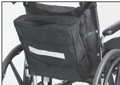
Secure ® Wheelchair Backpack in Black