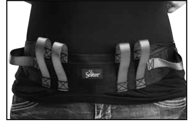
Secure ® Transfer & Walking Belt w/EZ Release Plastic Buckle