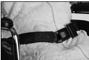
Secure ® Non-Alarming Quick-Release Wheelchair Seat Belt

Visit www.PadAlarm.com for more Fall/Wandering Management Products