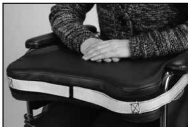
Secure ® Easy-Release Wheelchair Lap Cushion